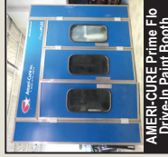
2019 AMERI-CURE Prime Flo Drive-In Paint Booth