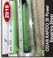
2019 CIDAN RAPIDO 30 Power Squaring Shear

TERMS: 18% Buyers Premium online @ Bidspotter.com plus 6% PA Sales Tax, unless exempt. Full payment upon Receipt of Invoice in Cash, Bank Check, Wire Transfer or Business Check with Bank Letter of Guarantee. No Credit Cards.