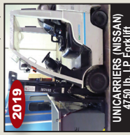
2019 UNICARRIERS (NISSAN) 4750 lb. LP Forklift