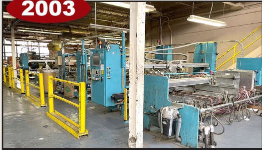
J & L Alliance Machine 150" Flexo Folder Gluer

Features: Corrugating Line, Flexo Folder Gluer & Die Cutting Lines, Palletizing Lines, 2000 LF Power Roller Conveyor, Quality Control Lab, Material Handling, Maintenance Shop, Waste Treatment Equipment, $500,000+ Auxiliary Rolls & Parts, Inks, Supplies & More