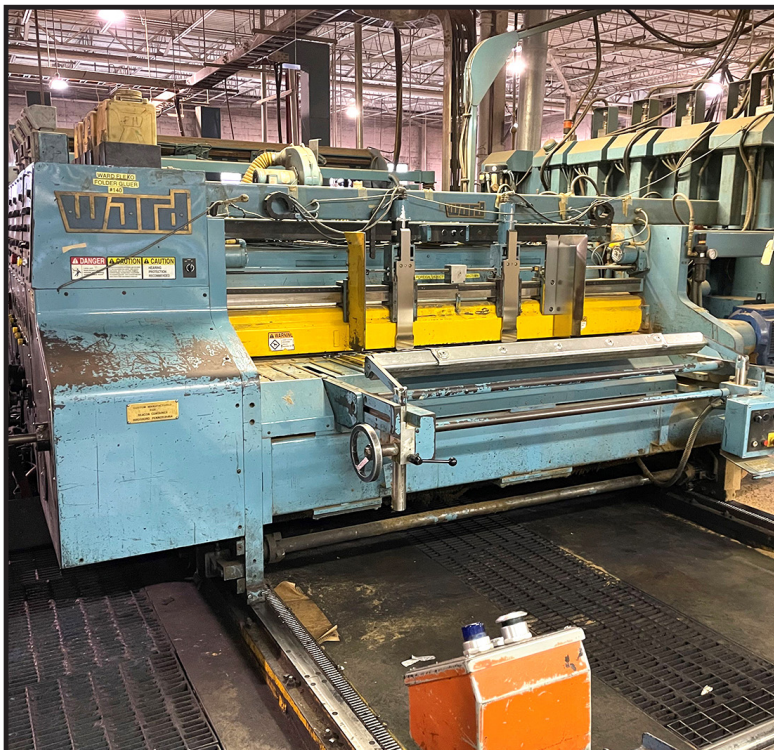
Ward 37-1/2" x 97" 3/Color Flexo Folder Gluer Die Cutter

Inspection: Friday, September 29th, 9:00 am to 3:00 pm