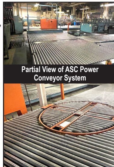
Partial View of ASC Power Conveyor System