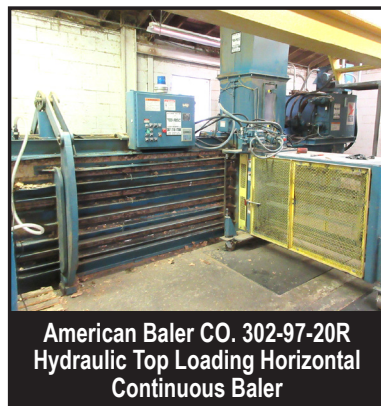
American Baler CO. 302-97-20R Hydraulic Top Loading Horizontal Continuous Baler