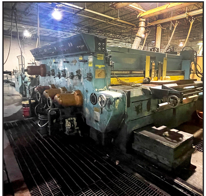
Ward 66" 125" 3/Color Flexo Die Cutter