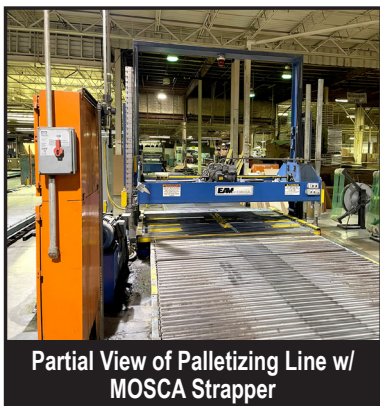
Partial View of Palletizing Line w/ MOSCA Strapper