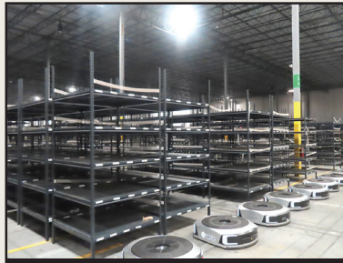
View of & MSU Shelving Units

FEATURING: (125) GEEK + ROBOTS, 2500+ MSU SHELVING UNITS, 100+ METAL PALLETS, 4000+ (6 RIVERS) SHELVING UNITS, FORKLIFTS, PALLET JACKS, GRAVITY 6000 LF GRAVITY ROLLER CONVEYOR, ZEBRA & PACKAGE PRINTERS, KEYENCE & ZEBRA SCANNERS, 60,000