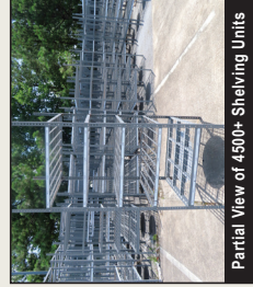
Partial View of 4500+ Shelving Units