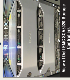
View of Dell EMC SCV3020 Storage Controllers

TERMS: 18% Buyers' Premium. Full Payment due in Cash, Bank Check or Wire Transfer. Business Check with Bank Letter of Guarantee. No Credit Cards or Personal Checks.