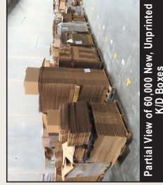
Partial View of 60,000 New, Unprinted K/D Boxes