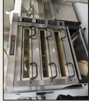
PIZZA MASTER PM733ED Electric 3-Deck Pizza Oven