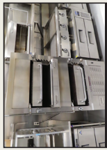
SOUTHBEND 270 SS Dbl. Deck Infrared Deck Radiant Broiler