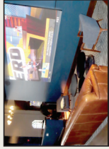
SAMSUNG QM85RA 4K UHD Smart Signage Digital Display

TERMS: 18% Buyers' Premium. Full Payment due in Cash, Bank Check or Wire Transfer. Business Check with Bank Letter of Guarantee. Immediate removal required.