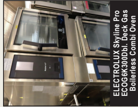
ELECTROLUX Skyline Pro EC0G6K300Dbl. Deck Gas Boilerless Combi Oven

AUDIO/VIDEO: $2,700,000 COST- (2) 1.56 mm pixel pitch LED Screens (8'9" x 9'2"), SAMSUNG- (1) QM98T, (8) QM85R-A, (10) QM75R-A, (22) QM65R-A, (8) QM55R-A & (16) QM43R-A 4K (SOME W/ UHD) Smart Signage (Digital Displays), PEERLESS Mounts, TRIPLEPLAY Digital Signage Media Players, (6) Xbox Series X Gaming Consoles, CRESTRON Touch Screens, Real Motion G8 Server, Blackmagic BMD Video Hub, tvONE CORIOmaster 2 Frame, CM2 HDMI-4K-4OUT Quad 4K60 Modules, S/PDIF Audio Module, Direct TV COM3000 Head End Receiver, QSC Audio Equipment, MIDDLE ATLANTIC Rack Systems, Speakers and more!