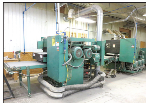
Timesaver 337-5BT Top/Bottom Sanders