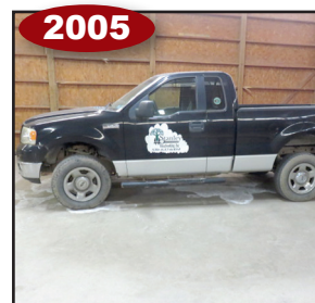
2005 Ford F-150 XLT 4x4 Pickup