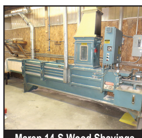
Maren 14-S Wood Shavings Baler