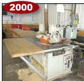
2000 Diehl Straight Line Rip Saw