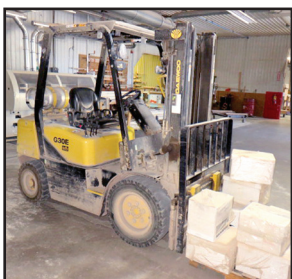
Daewoo G30E 5,500 LB LP Fork Lift