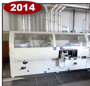
2014 SCMI Superset 23 Moulder