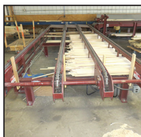
Mellott 7' x 22' 4-Chain Drive Conveyor