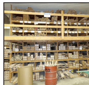
Partial View of Fabricated Wood Mouldings, Trim, Work-in-Process