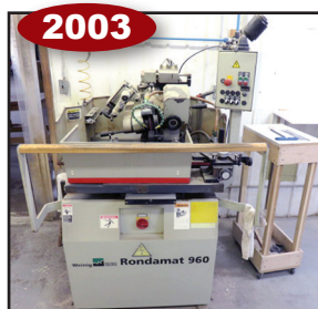
2003 Rondomat 960 Grinder