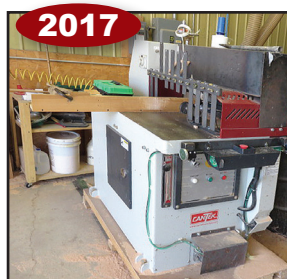
2017 Cantek CANPCS24R Chop Saw