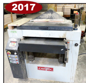
2017 Cantek P-630HV 24" Planer