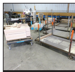
Partial View of Wood Carts & Metal Dollies