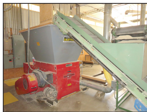
2001 Cresswood HF-36 Wood Grinder