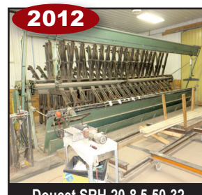
2012 Doucet SRH-20-8.5-50-32 Clamp Carrier