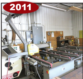
2011 Cameron Automated Quick-Rip Optimizing Gang Infeed System