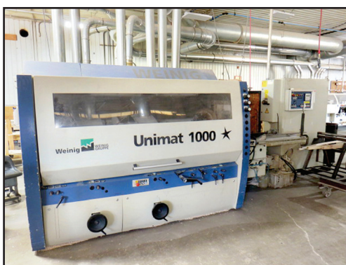
2003 Weinig Unimat 1000 Moulder

Inspection: Monday, June 13th from 9:00 am to 3:00 pm.