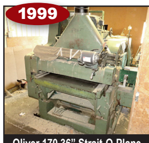
1999 Oliver 170 36" Strait-O-Plane Planer