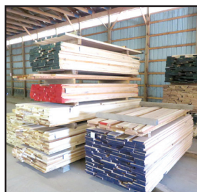
Partial View of Hardwoods