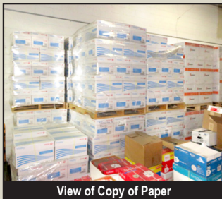
View of Copy of Paper