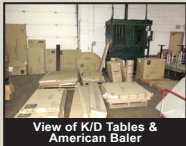
View of K/D Tables & American Baler