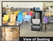
View of Seating