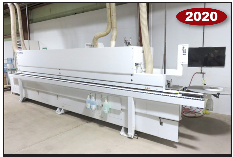
HOMAG EdgeTeq S-380 Profiline Edge Bander

Sale: Tuesday, February 22nd at 10:00 am, EST Inspection: Monday, February 21st, 9:00 am to 2:00 pm