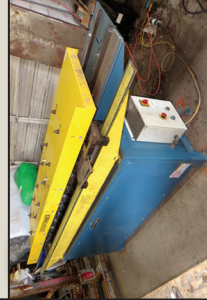
2014 LOCKFORMER TDC-V Machine