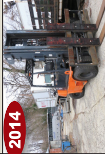
2014 DOOSAN G70S-5 Pneumatic Fork Lift

Inspection: Friday, January 28th from 9:00 am to 2:00 pm - BID ONLINE at BidSpotter!