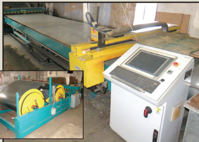
2014 VULCAN Plasma Line w/ Twin Uncoilers & Beader

Inspection: Friday, January 28th from 9:00 am to 2:00 pm at 5702 Newtown Avenue, Philadelphia, PA