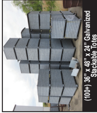
(100+) 36" x 48" x 24" Galvanized Stackable Totes

TOYOTA 023FD30 Diesel Pneumatic Fork Lift, Enclosed Cab. SN 3FD30 22285, Lift to 157", 6,750 LBS Cap., Side Shifter (5) 40 Sea Cargo Containers (fair to poor condition); (100+) 36" x 48" x 24" Galvanized Stackable Totes