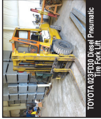
TOYOTA 023FD30 Diesel Pneumatic Tire Fork Lift