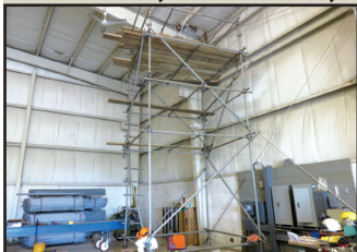
View of Assembled HD Tube & Coupler Scaffolding & Bundled Tube

Inspection: Wednesday, May 26th from 9:00am- 2:00pm