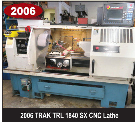
2006 TRAK TRL 1840 SX CNC Lathe

CNC & MANUAL MACHINE TOOLS, OBI PRESSES, MISCELLANEOUS FAB MACHINERY, TOOLING & ACCESSORIES, VIDMAR CABINETS, (9) SEA STORAGE CONTAINERS, VINTAGE VEHICLES SUPPORT, STEEL, & MORE! 122 MYRTLE AVENUE, LONG BRANCH, NEW JERSEY