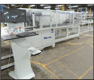
2018 PRO-Line AF325N Auto Feed Saw w/Notching Capability