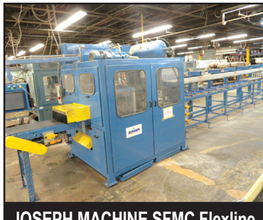
JOSEPH MACHINE SFMC Flexline Fabrication Machine Center