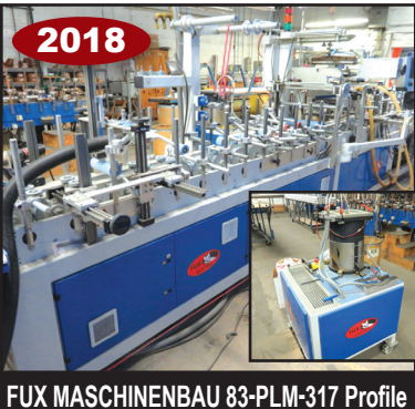
FUX MASCHINENBAU 83-PLM-317 Profile Laminating Line w/Glue Pre-Melter