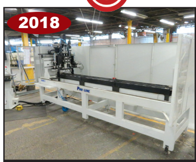
2018 PRO-LINE MC-330-06 3-Axis CNC Machining Center