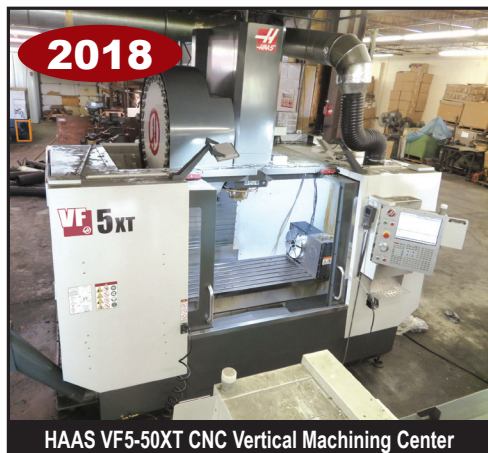
HAAS VF5-50XT CNC Vertical Machining Center