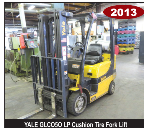
YALE GLC050 LP Cushion Tire Fork Lift