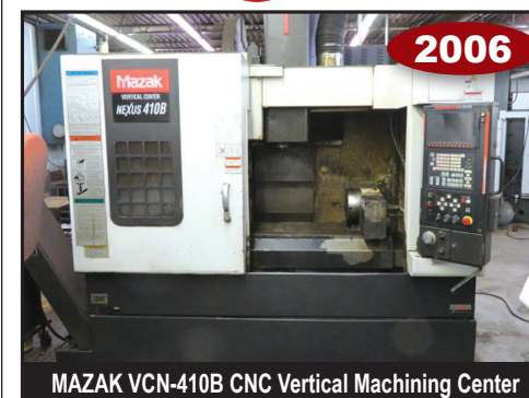
MAZAK VCN-410B CNC Vertical Machining Center