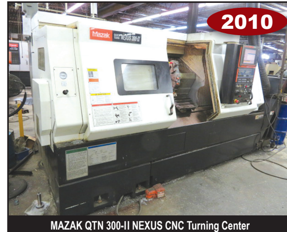
MAZAK QTN 300-II NEXUS CNC Turning Center