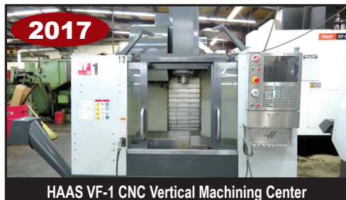
HAAS VF-1 CNC Vertical Machining Center