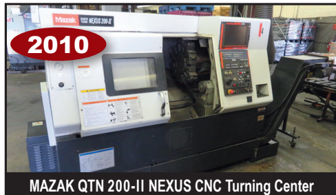
MAZAK QTN 200-II NEXUS CNC Turning Center