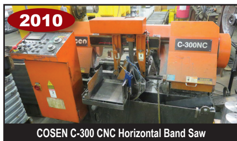
COSEN C-300 CNC Horizontal Band Saw