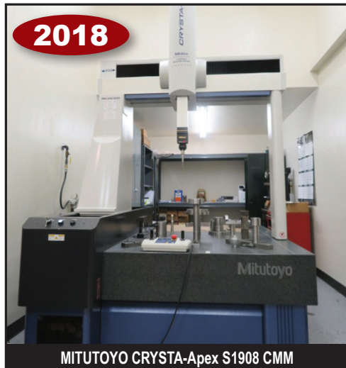
MITUTOYO CRYSTA-Apex S1908 CMM