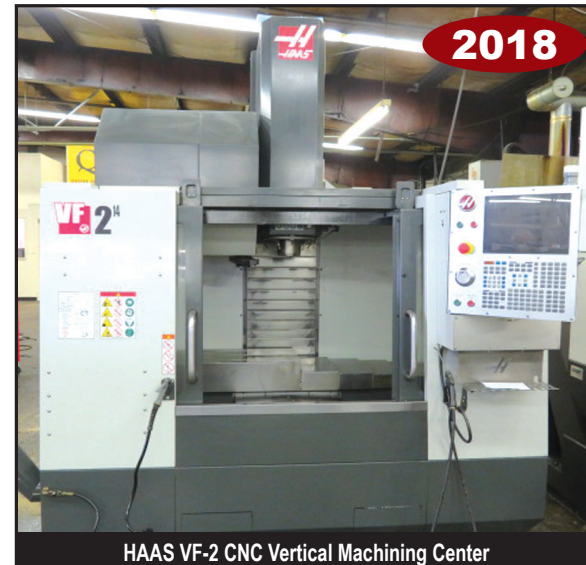
HAAS VF-2 CNC Vertical Machining Center