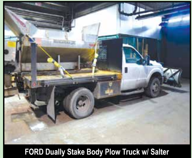
FORD Dually Stake Body Plow Truck w/ Salter