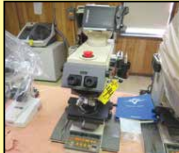
1 of 2 OLMPUS VANOX-T AH-2 Microscopes