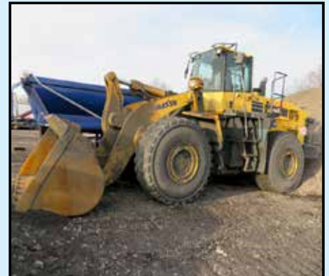
KOMATSU WA500-6 Rubber Tire Loader