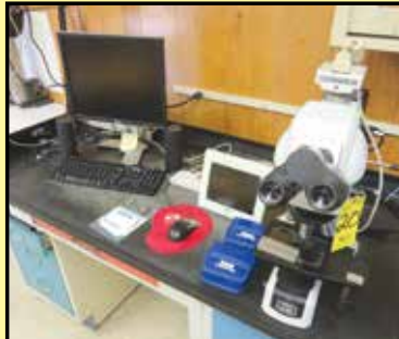
NIKON ECLIPSE LV150 Microscope