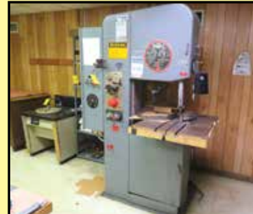
DOALL 2012-2H Vertical Band Saw