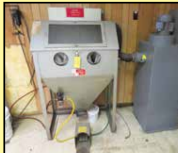
TRINCO 36 EP2 Sand Blast Cabinet