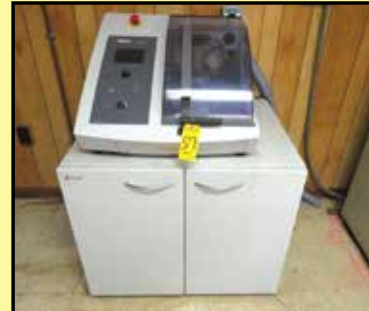
STRUERS Secotom-15 Cut-Off Saw