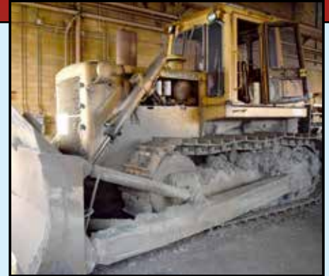
DRESSER TD-25G Crawler Dozer