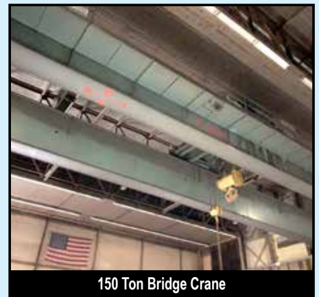
150 Ton Bridge Crane