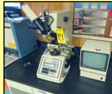
LECO M-400-M1 Micro Hardness Tester

Please Note: This facility may be subject to a sale in its entirety and if confirmed wii be removed from the Auction Schedule