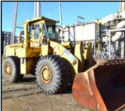
KAWASAKI 95Z11 Rubber Tire Loader

LODGE & SHIPLEY 20"x30' & SOUTH BEND Lathes • CINCINNATI BICKFORD 3' Arm x 10" Column Radial Arm Saw • 16" & 12" HD Dbl. End Grinders • DAKE 50H Hydraulic Press • WILTON 7"x12" Belt & RACINE Hack Saws • BUFFALO 22" & ROCKWELL 15" Drill Presses • (15+) EQUIPTO Tooling Cabinets, Tooling, Drills, Taps, Dies, etc., DUMORE Tool Post Grinder, KENNEDY Tool Boxes, Inspection (Mics, Gages, etc.) Mag Drill, DAYTON Sand Blast Cabinet, HD 4' Power Squaring Shear, 3/8", DELTA Carbide Grinder •