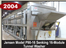
Jensen Model P90-16 Sanking 16-Module Tunnel Washer