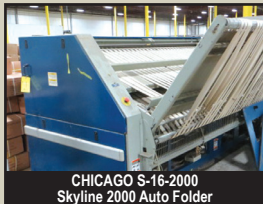
CHICAGO S-16-2000 Skyline 2000 Auto Folder

Inspection: Friday, February 9th, 9:00 am to 1:00